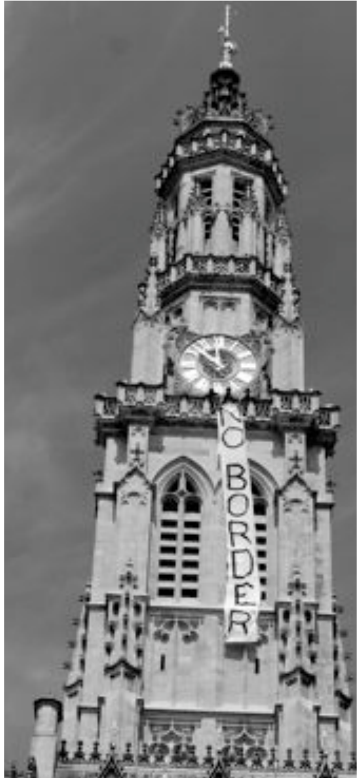
Arras market, France june 2010

It took 8 years for a No Border Camp to happen again in France. Only one year after, there is another one not far away from Calais. From the 25th of September to the 3rd of October 2010, the next one will take place in Brussels. Belgians activists managed to block Lesquin – near Lille – detention centre during Calais camp. Since then among other nice things, they simultaneously blocked 2 detention centres out of the 3 officially existing in Belgium ! The No Border network is being structured regionally near the UK-FR-BE border. It is capable to organise actions of various sizes. It's time to create new No Border collectives or to join it. Be it to organise an event for the camp infotour,