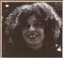
Angela Y. Davis

"In this extraordinary book, Angela Davis challenges us to confront the human rights catastrophe in our jails and prisons. As she so convincingly argues, the contemporary U.S. practice of super-incarceration is closer to new age slavery than to any recognizable system of 'criminal justice.'"